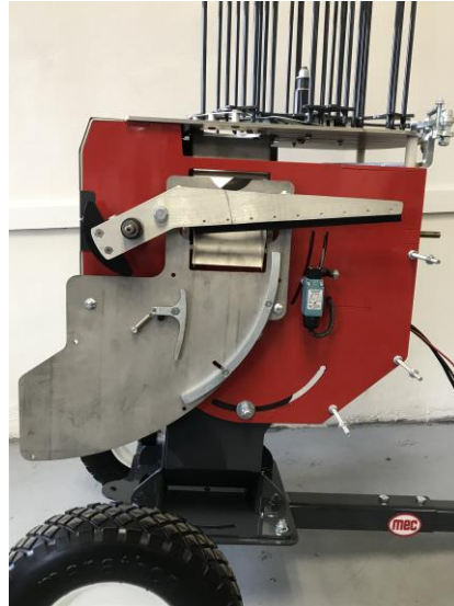
*Machine pictured on optional T-cart

Step 3 – With the Rabbit Plate removed, it now needs to be attached to the front side of the Throwing Plate as shown in the photo below. Simply hold the plate straight to the throwing plate and push the front rail to the full open position. Slide plate on and release the front rail. Replace the Allen bolts to securely attach the rabbit plate to the throwing plate.